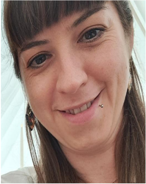
Senior Residential Worker